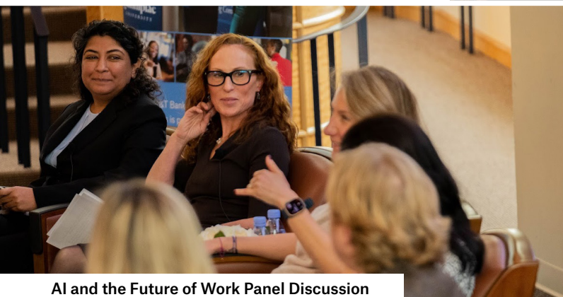
AI and the Future of Work Panel Discussion