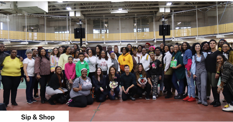
Sip & Shop