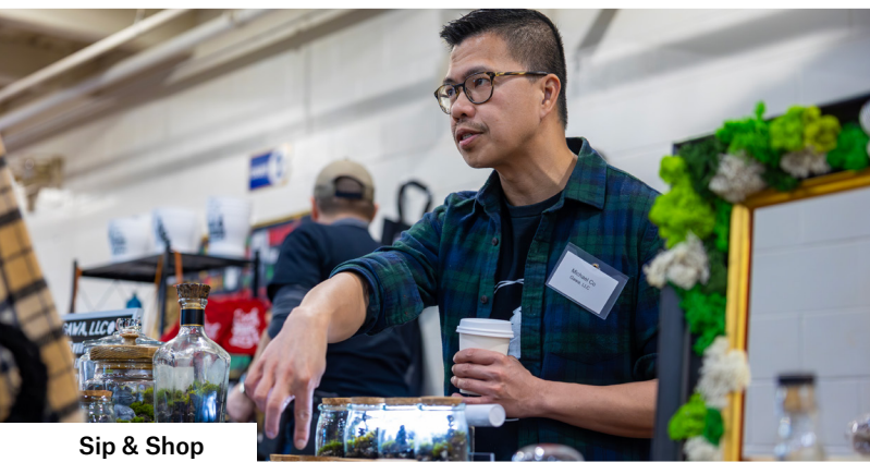
Sip & Shop