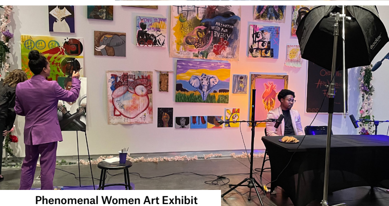
Phenomenal Women Art Exhibit